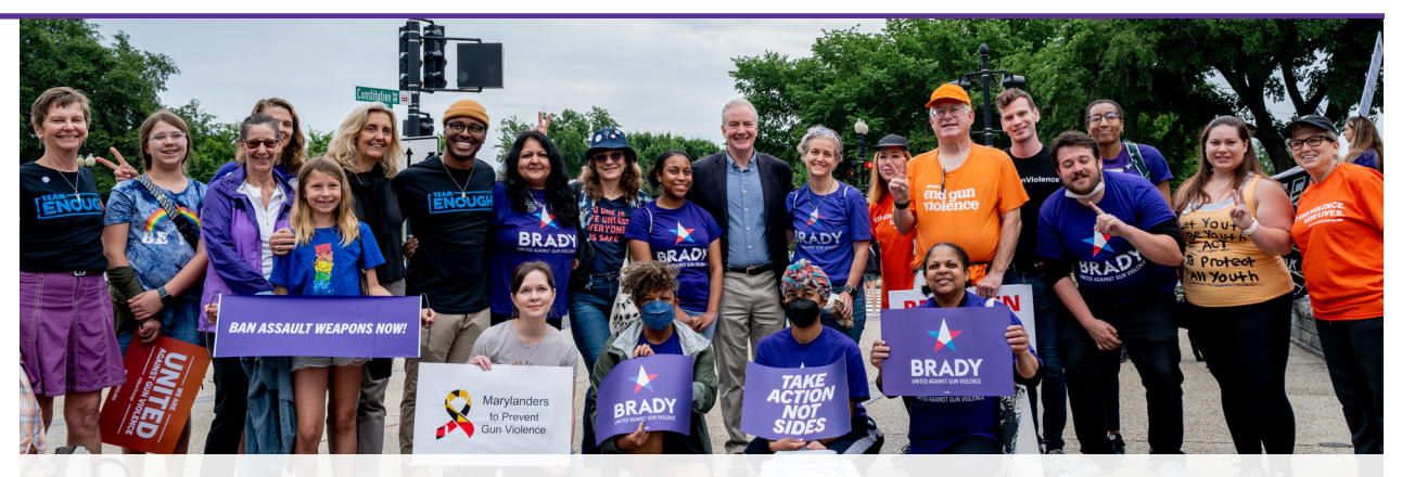
BRADY AND TEAM ENOUGH SUPPORTERS GATHER AT THE 2022 MARCH FOR OUR LIVES IN WASHINGTON, D.C.

BRADY AND TEAM ENOUGH'S EFFORTS IN COMMUNITIES AND STATEHOUSES ACROSS THE COUNTRY HAVE RESULTED IN THE RECENT PASSAGE OF MORE THAN 35 LIFE-SAVING GUN VIOLENCE PREVENTION LAWS.