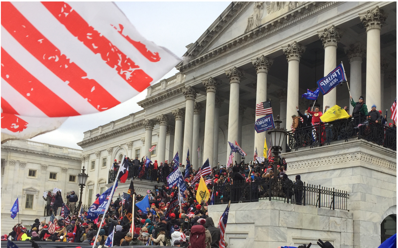
Insurrectionists storm the U.S. Capitol on January 6, 2021.

for Gun Rights and the National Association for Gun Rights argued that, in “[o]ur particular form of government ... it is the individual citizen who ultimately possesses inalienable and pre-existing rights such as the right to keep and bear arms for self-defense against tyranny and violence.” What constitutes “tyranny” is in the eye of the beholder, of course — and some January 6 rioters believed that their effort to overturn a legitimate election was actually a fight against just that: a tyrannical government. That is why it would be so dangerous for the Supreme Court to accept any of these extremist arguments.