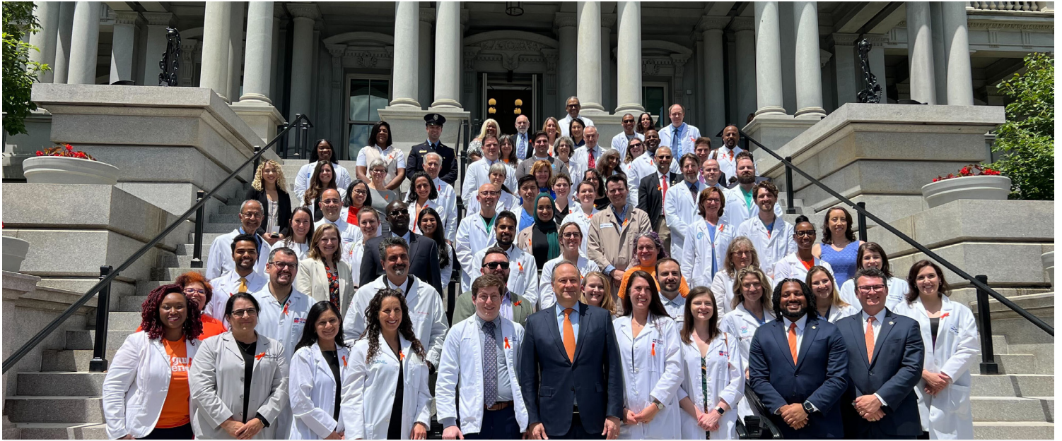
This Is Our Lane members join other healthcare professionals and first responders at a White House event.

Navigating challenging conversations is an inherent aspect of our roles as healthcare professionals. One particularly sensitive topic often avoided is firearm safety, driven by concerns of alienating patients. However, research underscores that most patients welcome discussions initiated by healthcare providers about firearms, especially in contexts of heightened risk such as presence of serious mental health concerns, substance misuse, dementia, or when children or teens live in the household.